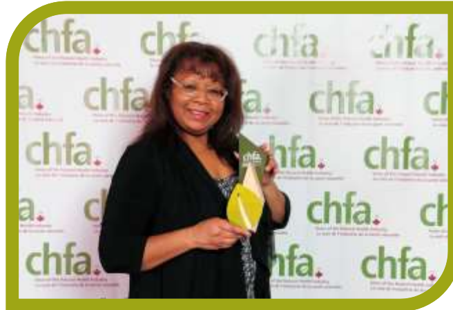
People's Choice – BioK+