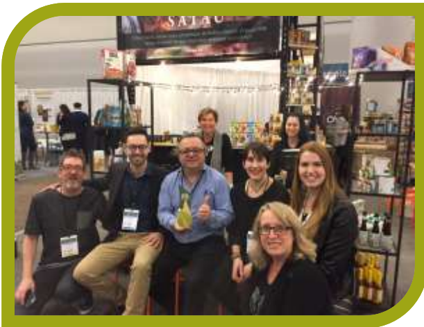
Large Booth - Satau