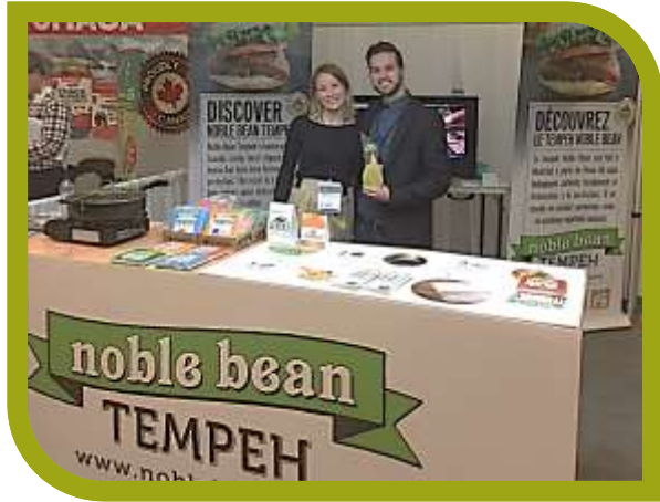
Small Booth – Nobel Bean Tempeh