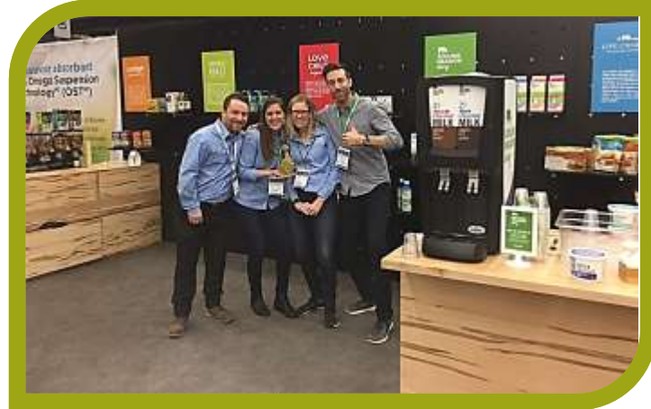
Medium Booth – GreenSpace Brands